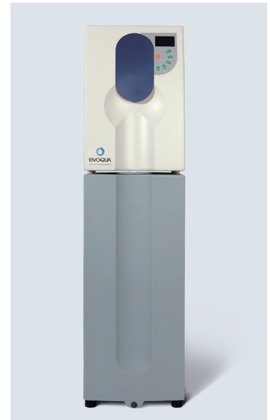
Ultra Clear RO System with 80 L tank

*: 115 V upon request; **: based on the RO membrane elements actually used